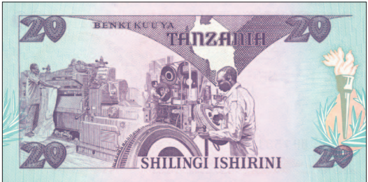
BOT B9 (P9): 20 shillings (US$0.01)