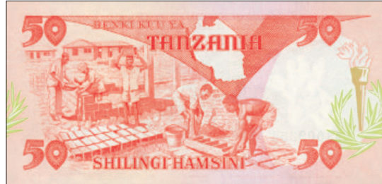
BOT B10 (P10): 50 shillings (<US$0.05)