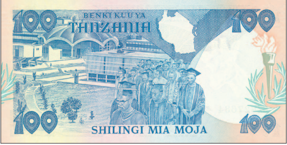
BOT B14 (P14): 100 shillings (US$0.05)

Blue, purple, and green. Front: Torch; coat of arms; first president, Julius Kambarage Nyerere. Back: University of Dar es Salaam campus buildings on Observation Hill; students in graduation procession; map of Tanzania with islands; torch. Solid security thread. Watermark: Giraffe head. Printer: (TDLR). 150 x 76 mm.