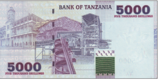
BOT B37 (P38): 5,000 shillings (US$3.15)

Purple. Front: Coat of arms; balancing rocks; black rhinoceros. Back: House of Wonders (Beit el Ajaib) building in Zanzibar; mining machinery. Holographic stripe. Windowed security thread with demetalized BOT 2003. Watermark: Giraffe head with electrotype 5000. Printer: (G&D). 145 x 72 mm.