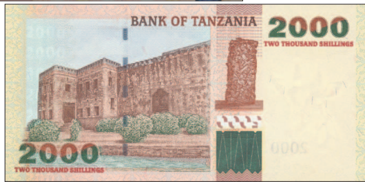
BOT B36 (P37): 2,000 shillings (US$1.25)

Tan and brown. Front: Coat of arms; Mount Kilimanjaro; lion. Back: Old Omani Arab Fort (Ngome Kongwe) in Zanzibar's Stone Town; carved block. Holographic stripe. Windowed security thread with demetalized BOT 2003. Watermark: Giraffe head with electrotype 2000. Printer: (G&D). 140 x 69 mm.