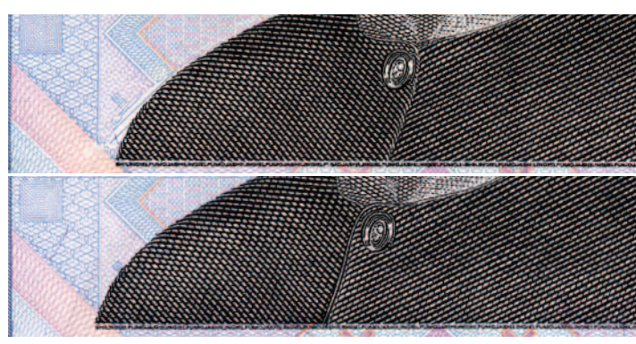
Shirt buttoned incorrectly on B35a (top), and on "masculine" side on B35b (bottom).

a. No date. Signature 14. Intro: 03.02.2003. F۷ 2 □ b. Nyerere's shirt buttoned on "masculine" side. F۷ Intro: 08.08.2006.